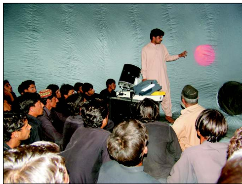
Students are being briefed by Science Caravan Jaffarabad Unit Staff inside Planetarium system at Usta Muhammad.

Science Caravan Sindh Unit (Sukkur) arranged science caravan exhibition at Govt. Boys High School, Taluka Mehar District Dadu on December 9-20, 2012 and 3,550 students and teachers from 20