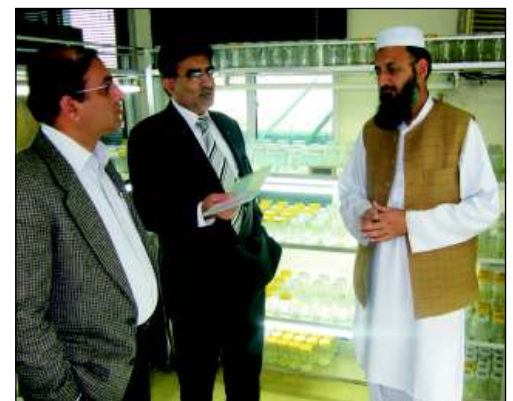
PSF monitoring team observes the laboratory trails at NIFA Peshawar.