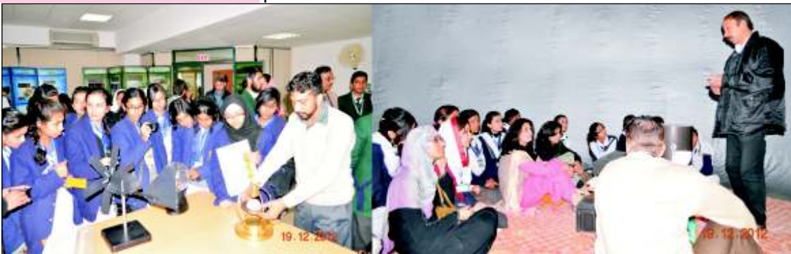
PSF officials brief students about scientific models and solar system (planetarium show) during the Winter Science Camp at NCP.