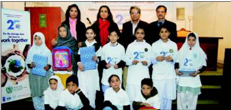
A group photo of winner students and organizers of the art competition on Ozone layer