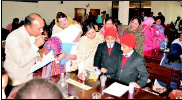
Hands on activities of the students being assessed by the experts from NISTE during the Review Meeting of LAMAP on December 20, 2012.

On this occasion, eight schools which got Rs 25,000 each grant for Science Clubs in 2nd Phase included IMS, Near Mughal Market, I - 8/1, Islamabad, IMCB, F-7/3, Islamabad, IMS (Boys) (VI-X), I -10/2, Islamabad, FGBS, Lohibhair, Islamabad, IMS (Boys) Rawal Dam, Islamabad, FGGSS, QAU