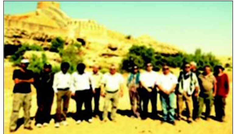
The French Consul General with the PMNH, Paris Museum of Natural History and University of Sindh, Jamshoro scientists at Ranikot, Sindh.

ESD, Paris Museum of Natural History and University of Sindh scientists also carried out joint field work in the village of Ranikot, 50 Km east of Jamshoro, Sindh. Consul General of French Embassy (Karachi) along with his delegation also visited the Ranikot Fort. He encouraged PMNH and French Museum of Natural History's research collaboration.