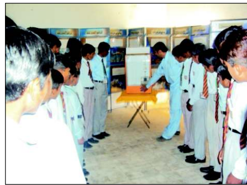
Students are being briefed about Scientific Models (Tandojam Unit)

schools participated. The Tandojam Unit arranged exhibition at Govt High School (Boys and Girls) Nagarparker and Chachro District Tharparker from November 20 to December 08, 2012.