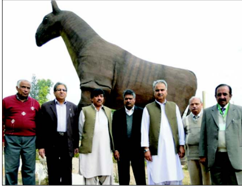
Secretaries, Forest & Wildlife and Livestock & Dairy Departments, Balochistan and PMNH officers pose for group photo with life-size display of Baluchitherium at PMNH.